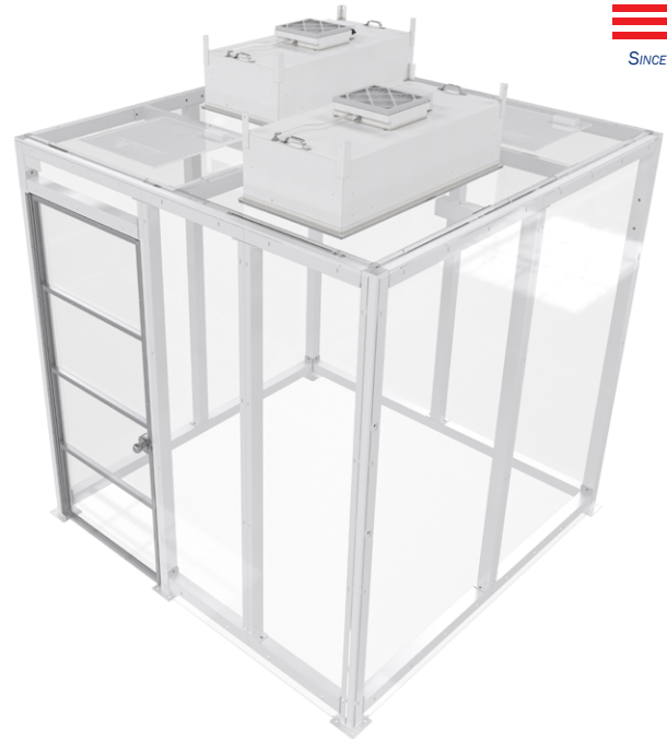
Quick Ship Walk-in Modular Cleanroom with 2 Fan Filter Units

Custom Walk-in Cleanrooms are available with a 4-5-week lead time after design approval. Please consult your Sentry Air Application Specialist for more information.